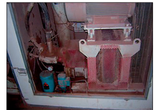
One of the 4 presses type SITI MAGNUM