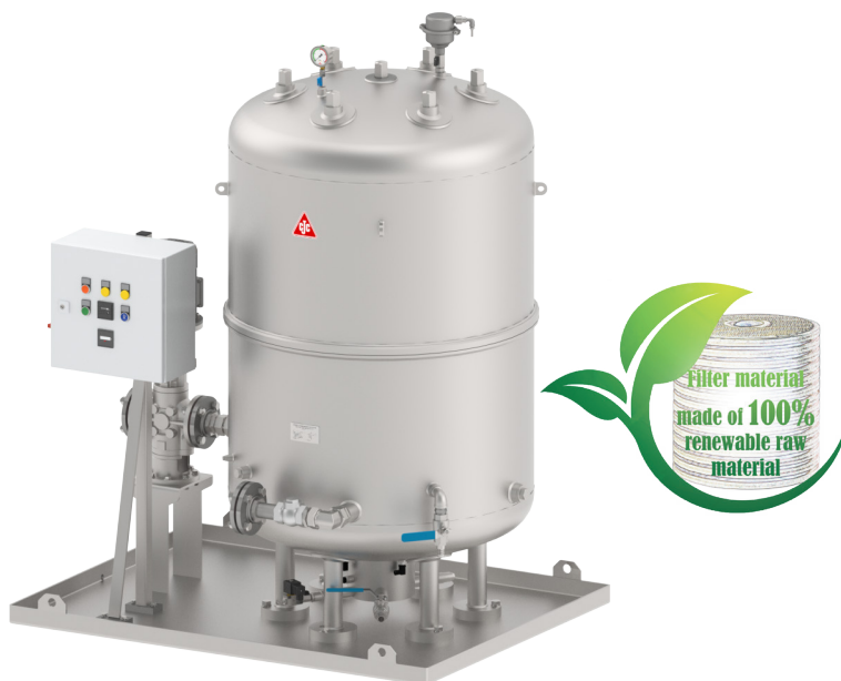
CJC® Filter Separator P7 727/108