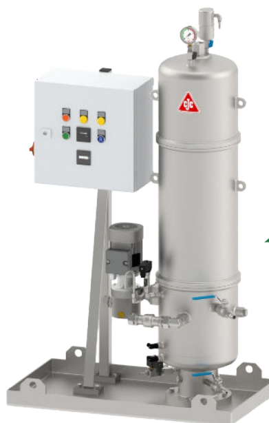
CJC® Filter Separator P4 27/81