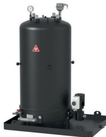
CJC™ Fine Filter unit 427/108