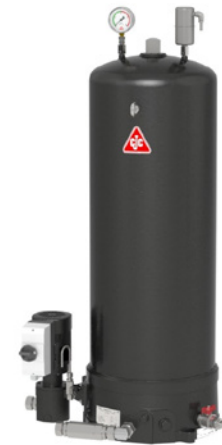
CJC™ Fine Filter unit 38/100