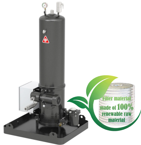
CJC™ Filter Separator P1 27/81